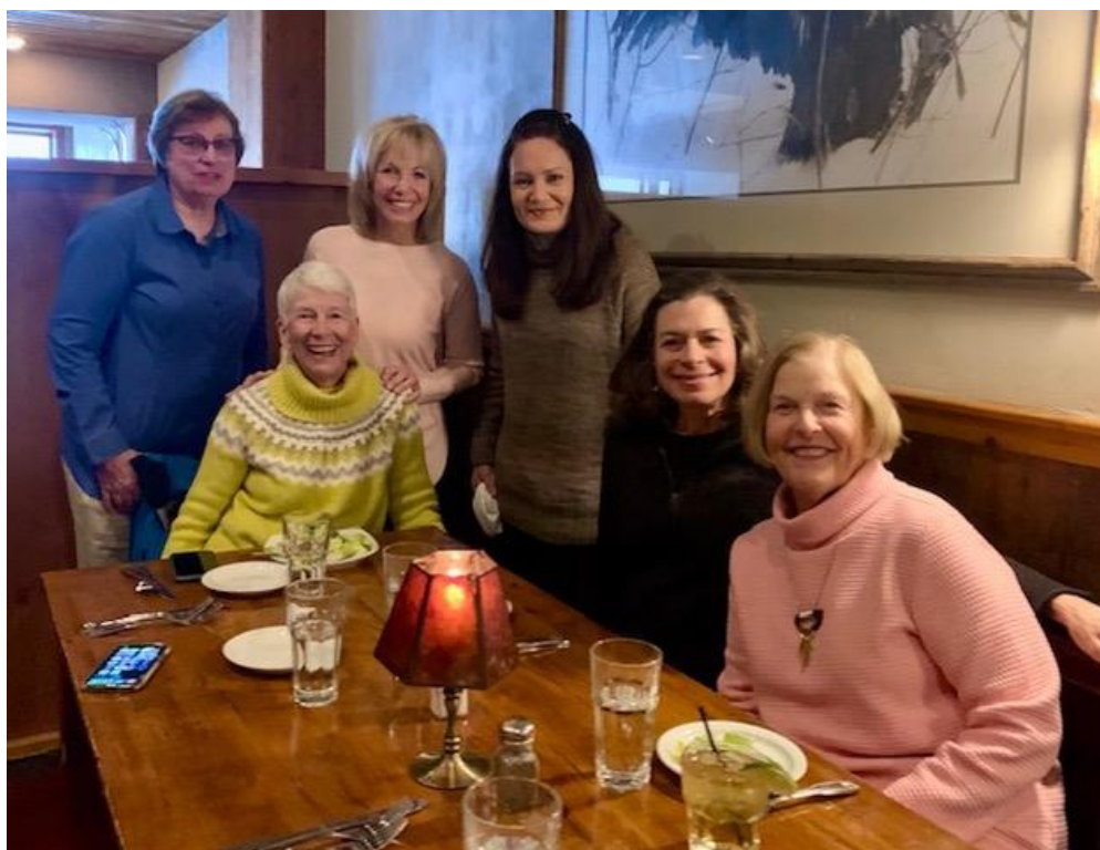
The Board of Directors, Clockwise: