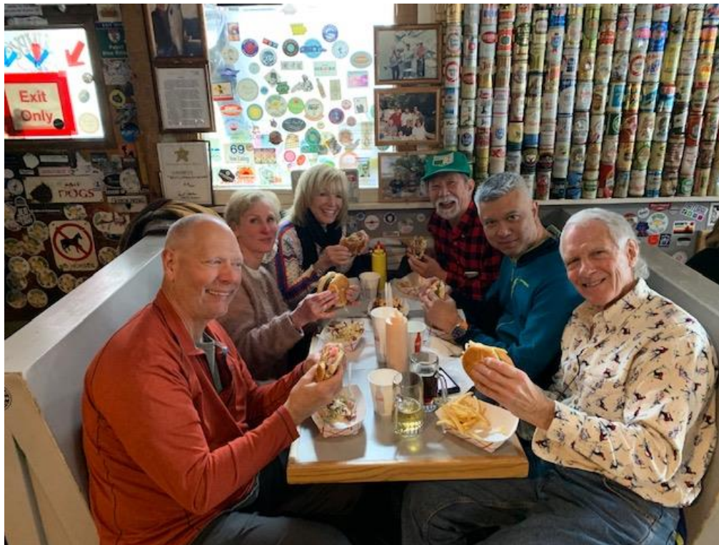
Fuel for the Slopes – Clockwise: