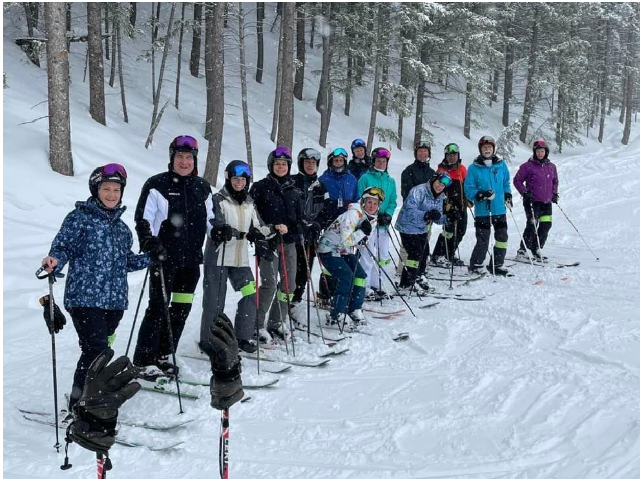
The Mountain Tour Group