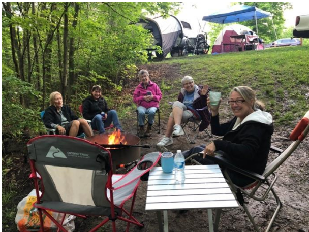
Pics from Summer of 2022