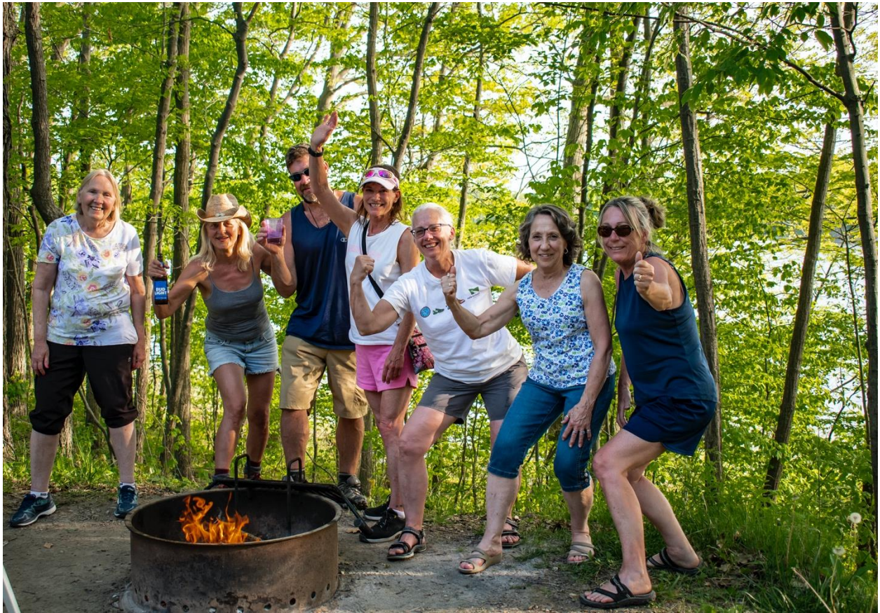
Pic from Summer of 2021